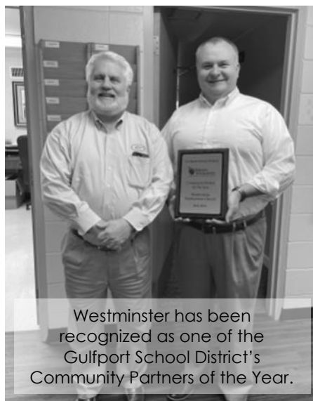
Westminster has been recognized as one of the Gulfport School District's Community Partners of the Year.

WESTMINSTER presbyterian church | epc phone 228.864.3143 gulfportchurch.org