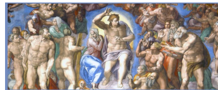
Revelation: A Study Tuesdays at 11:30 a.m. April 9-June 4 (except May 7)